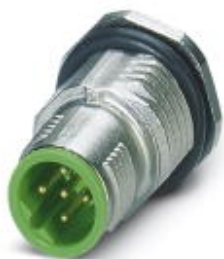
Sensor/actuator flush-type plug, with green contact carrier, 5-pos., M12 SPEEDCON, shielded, B-coded, rear/screw mounting with M16 thread, with straight solder connection

Please be informed that the data shown in this PDF Document is generated from our Online Catalog. Please find the complete data in the user's documentation. Our General Terms of Use for Downloads are valid ( http://phoenixcontact.com/download )