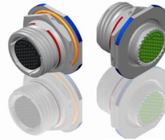
LAYOUT SHOWN AS EXAMPLE