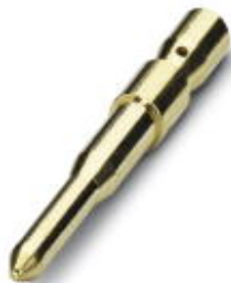
Crimp contact, turned, contact diameter: 1.5 mm, crimp range: 0.08 mm 2 ... 0.22 mm 2

Please be informed that the data shown in this PDF Document is generated from our Online Catalog. Please find the complete data in the user's documentation. Our General Terms of Use for Downloads are valid ( http://phoenixcontact.com/download )