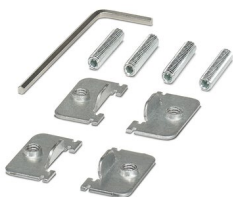
HMI mounting kit for installation on a front plate. The mounting kit includes 6 x mounting brackets, 6 x screw threads, and a hexagonal wrench.

https://www.phoenixcontact.com/us/products/2701385