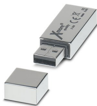
USB memory stick, 8 GB

https://www.phoenixcontact.com/us/products/2402809