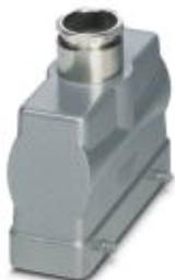
HEAVYCON B24 sleeve housing, for double locking latch, height: 76 mm, with 1 x Pg29 screw connection, straight cable outlet

Please be informed that the data shown in this PDF Document is generated from our Online Catalog. Please find the complete data in the user's documentation. Our General Terms of Use for Downloads are valid ( http://phoenixcontact.com/download )