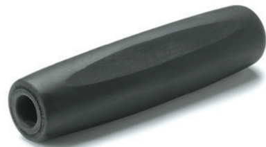
ERGOSTYLE® ELESA Original design