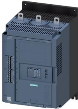
SIRIUS soft starter 200-480 V 171 A, 110-250 V AC Screw terminals Thermistor input