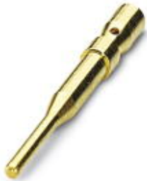
Crimp contact, turned, contact diameter: 1 mm, crimp range: 0.14 mm 2 ... 0.56 mm 2

Please be informed that the data shown in this PDF Document is generated from our Online Catalog. Please find the complete data in the user's documentation. Our General Terms of Use for Downloads are valid ( http://phoenixcontact.com/download )