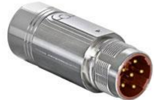
Contact Arrangement mating view

B KU A 186 NN 00 59 0100 000 B K A 186 N 00 59 0100 000