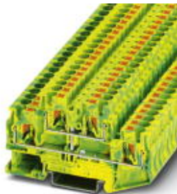
Protective conductor double-level terminal block, connection method: Push-in connection, cross section: 0.2 mm 2 - 6 mm 2 , AWG: 24 - 10, width: 6.2 mm, color: green-yellow, mounting type: NS 35/7,5, NS 35/15

Please be informed that the data shown in this PDF Document is generated from our Online Catalog. Please find the complete data in the user's documentation. Our General Terms of Use for Downloads are valid ( http://phoenixcontact.com/download )