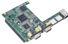
MIO-6260 Multi I/O Module with 1 Ethernet, 2 COM, 4 USB