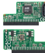
PCM-233C IDE (44-pin) to SATA Converter Module