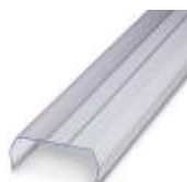
Cover profile, for covering terminal strips, snapped onto APT-ME cover profile carrier or APH-ME end bracket. A cover profile carrier should be positioned at the ends and at intervals of around 40 cm. Length supplied: 1 m