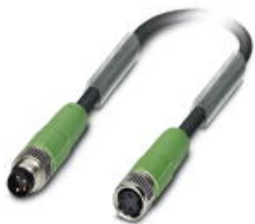
Sensor/actuator cable, 4-position, PUR halogen-free, black-gray RAL 7021, shielded, Plug straight M8, on Socket straight M8, cable length: 1.5 m

Please be informed that the data shown in this PDF Document is generated from our Online Catalog. Please find the complete data in the user's documentation. Our General Terms of Use for Downloads are valid ( http://phoenixcontact.com/download )