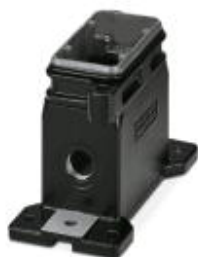
HEAVYCON B6 box mounting base, for screw locking, HPR series, with 2 x M20 gland, for increased environmental and EMC requirements

Please be informed that the data shown in this PDF Document is generated from our Online Catalog. Please find the complete data in the user's documentation. Our General Terms of Use for Downloads are valid ( http://phoenixcontact.com/download )