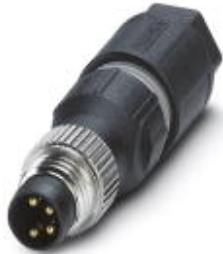
Sensor/actuator connector, male connector, straight, 4-pos., M8, QUICKON-ONE, metal knurl, maximum cable diameter of 5.0 mm

Please be informed that the data shown in this PDF Document is generated from our Online Catalog. Please find the complete data in the user's documentation. Our General Terms of Use for Downloads are valid ( http://download.phoenixcontact.com )