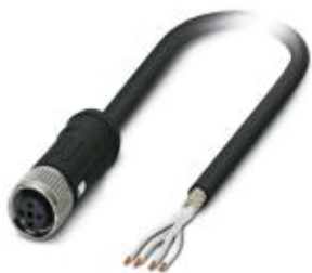
Sensor/actuator cable, 4-position, PE-X halogen-free, black, shielded, free cable end, on Socket straight M12 SPEEDCON, A-coded, cable length: 2 m, For railway applications

Please be informed that the data shown in this PDF Document is generated from our Online Catalog. Please find the complete data in the user's documentation. Our General Terms of Use for Downloads are valid ( http://phoenixcontact.com/download )