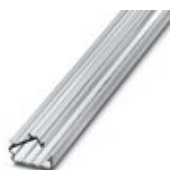
Cover profile, length: 300 mm, color: transparent