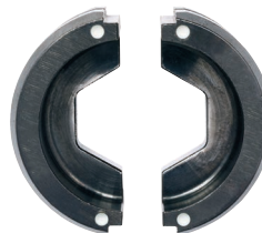
Greenlee Hex Die