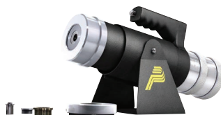
Pico Series 500