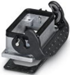
HEAVYCON panel mounting base HV3, with single locking latch, height 27 mm

Please be informed that the data shown in this PDF Document is generated from our Online Catalog. Please find the complete data in the user's documentation. Our General Terms of Use for Downloads are valid ( http://phoenixcontact.com/download )