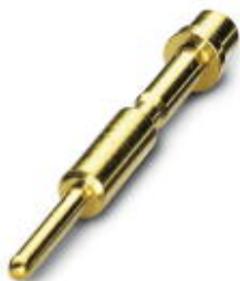
Crimp contact, turned, Single contact, contact diameter: 1 mm, crimp range: 0.34 mm 2 ... 0.5 mm 2

Please be informed that the data shown in this PDF Document is generated from our Online Catalog. Please find the complete data in the user's documentation. Our General Terms of Use for Downloads are valid ( http://phoenixcontact.com/download )