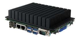
IB916 with Heat spreader