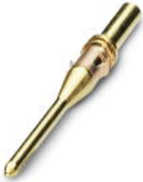
Crimp contact, turned, contact diameter: 1 mm, crimp range: 0.14 mm 2 ... 0.75 mm 2

Please be informed that the data shown in this PDF Document is generated from our Online Catalog. Please find the complete data in the user's documentation. Our General Terms of Use for Downloads are valid ( http://phoenixcontact.com/download )