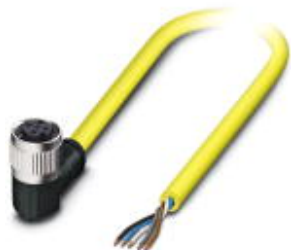
Sensor/actuator cable, 5-position, PVC, yellow, free cable end, on Socket angled M12 SPEEDCON, A-coded, cable length: 2 m

Please be informed that the data shown in this PDF Document is generated from our Online Catalog. Please find the complete data in the user's documentation. Our General Terms of Use for Downloads are valid ( http://phoenixcontact.com/download )