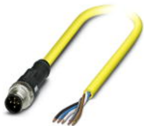
Sensor/actuator cable, 5-position, PVC, yellow, Plug straight M12 SPEEDCON, A-coded, on free cable end, cable length: 10 m

Please be informed that the data shown in this PDF Document is generated from our Online Catalog. Please find the complete data in the user's documentation. Our General Terms of Use for Downloads are valid ( http://phoenixcontact.com/download )