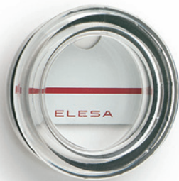
ELESAs Original design

Chamfer hole 1x45° and grease slightly the outside surface of the O-ring to make assembly easier.