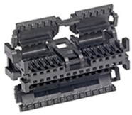
Mini 50 24ckt receptacle housing