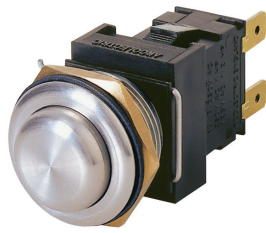
H8300RP - - -