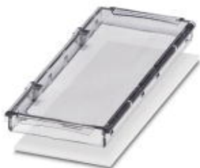
Installation component housing, Transparent hinged cover, Including insertion plate, width: 107.6 mm

Please be informed that the data shown in this PDF Document is generated from our Online Catalog. Please find the complete data in the user's documentation. Our General Terms of Use for Downloads are valid ( http://phoenixcontact.com/download )