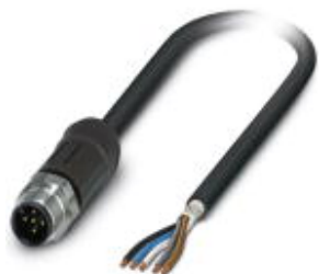
Sensor/actuator cable, 5-position, PE-X/PE-X halogen-free, black-gray RAL 7021, shielded, Plug straight M12, A-coded, on free cable end, cable length: 5 m, for outdoor applications, with high-grade steel knurl

Please be informed that the data shown in this PDF Document is generated from our Online Catalog. Please find the complete data in the user's documentation. Our General Terms of Use for Downloads are valid ( http://phoenixcontact.com/download )