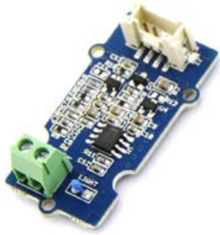
Grove - High Temperature Sensor