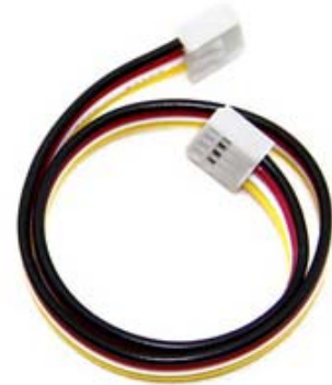
Grove - 20cm Cable