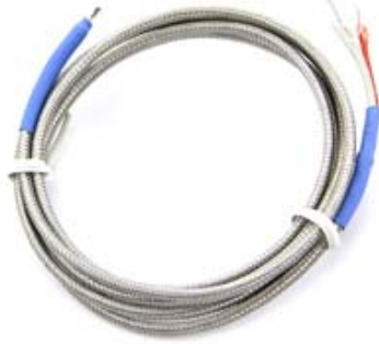
Thermocouple Temperature Sensor