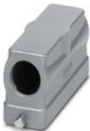
HEAVYCON B24 sleeve housing, for single locking latch, height: 65 mm, with 1 x M25 thread, lateral cable outlet

Please be informed that the data shown in this PDF Document is generated from our Online Catalog. Please find the complete data in the user's documentation. Our General Terms of Use for Downloads are valid ( http://phoenixcontact.com/download )