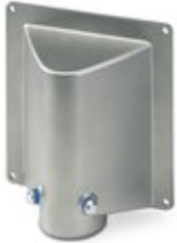
Adapter for mounting on 48 mm standard tube

Please be informed that the data shown in this PDF Document is generated from our Online Catalog. Please find the complete data in the user's documentation. Our General Terms of Use for Downloads are valid ( http://phoenixcontact.com/download )