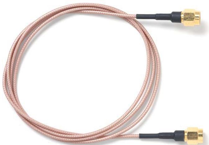
Model 4846-UU SMA Plug to SMA Plug, RG178B/U

Small size, and durability for confident connections