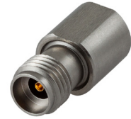
Generic photo used for illustration purposes only