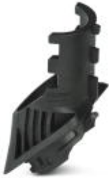
Strain relief, type: B6 - B24

Please be informed that the data shown in this PDF Document is generated from our Online Catalog. Please find the complete data in the user's documentation. Our General Terms of Use for Downloads are valid ( http://phoenixcontact.com/download )