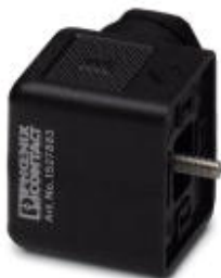
Valve connectors, Universal, 4-position, Valve connector A, Screw connection, cable gland Pg9, external cable diameter 6 mm ... 8 mm

Please be informed that the data shown in this PDF Document is generated from our Online Catalog. Please find the complete data in the user's documentation. Our General Terms of Use for Downloads are valid ( http://phoenixcontact.com/download )