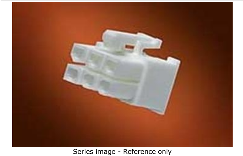
Series image - Reference only