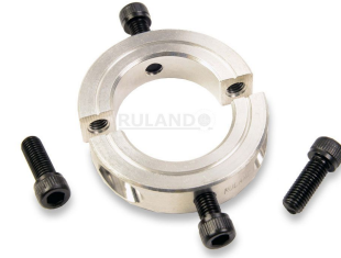
*Additional hardware NOT included