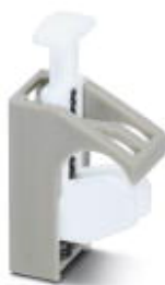
Cable marker carrier, gray, unlabeled, mounting type: clip on, cable diameter range: 4.8 ... 11 mm, lettering field size: 20 mm x 8 mm

Please be informed that the data shown in this PDF Document is generated from our Online Catalog. Please find the complete data in the user's documentation. Our General Terms of Use for Downloads are valid ( http://phoenixcontact.com/download )