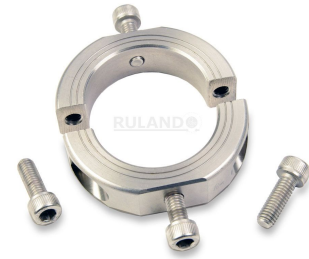
*Additional hardware NOT included