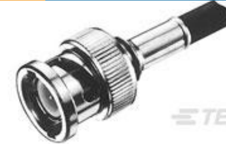
TE Part #227079-9 COMM. BNC-PLUG