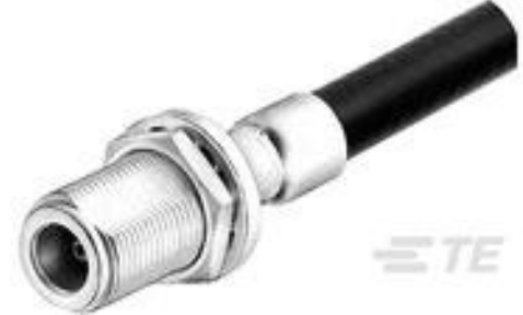
TE Part #225094-1 N SER BHD JACK WEATHERPROOF