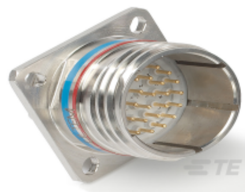
TE Part #YDTS20F21-16AC0000 SQUARE FLANGE RECEPTACLE