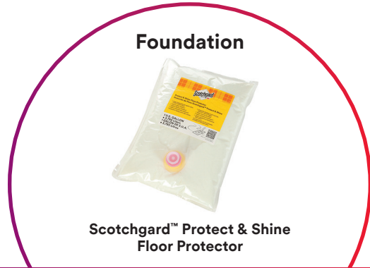
Scotchgard™ Protect & Shine Floor Protector