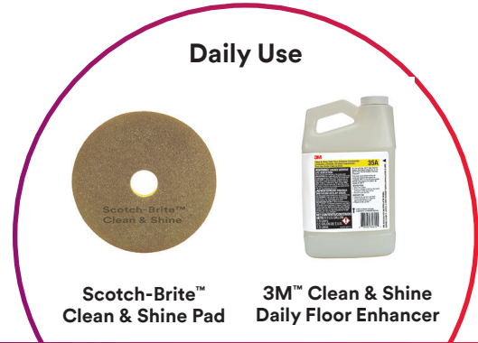
Scotch-Brite™ Clean & Shine Pad