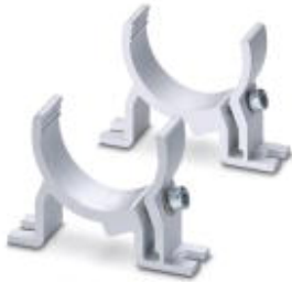
Mounting holder, AlMgSi0,5: Aluminum, for machine lights PLD M 260 .../D40, Swiveling range \pm 20^\circ

Please be informed that the data shown in this PDF Document is generated from our Online Catalog. Please find the complete data in the user's documentation. Our General Terms of Use for Downloads are valid ( http://phoenixcontact.com/download )