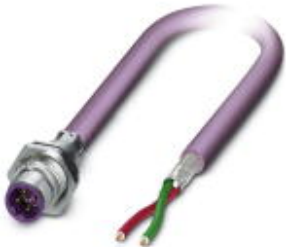
Bus system flush-type plug, PROFIBUS, 2-pos., M12, shielded, B-coded, rear/screw mounting with M16 thread, with 2 m bus cable, 2 x 0.25 mm 2

Please be informed that the data shown in this PDF Document is generated from our Online Catalog. Please find the complete data in the user's documentation. Our General Terms of Use for Downloads are valid ( http://phoenixcontact.com/download )