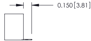
554 Contact Code