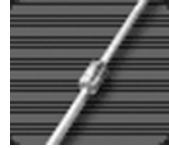
DO-204AH (DO-35 Glass)