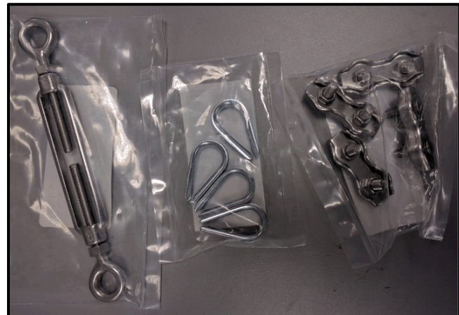
After the change