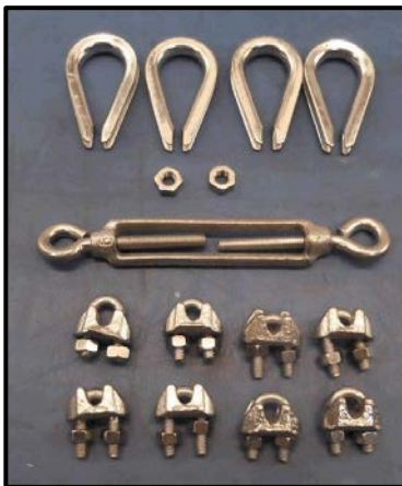
Before the change

The look, feel and performance of the TURNBUCKLE, 4 THIMBLES is the same; the 8 ROPE GRIPS have changed in their look but perform the same function.