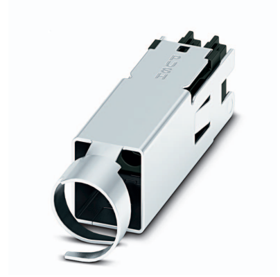
The figure shows a 2-pos. version with 4 contacts