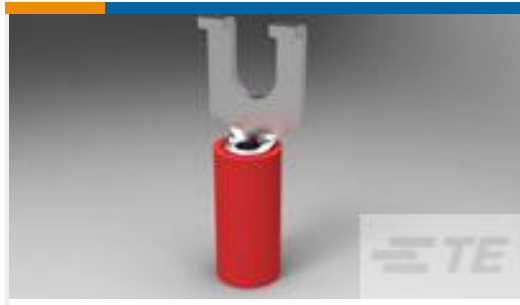
TE Part #32562 PIDG SPDFLG 22-16COMM22-18MIL6