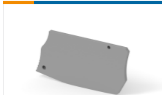
TE Part #1SNK505911R0000 ES6-4S