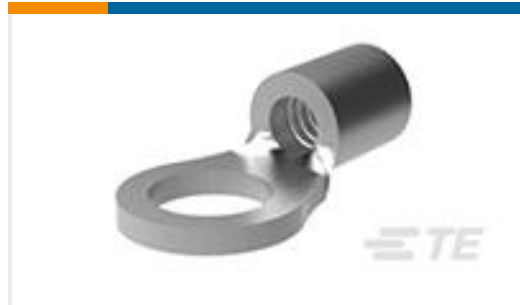
TE Part #34107 SOLIS R 22-16 COMM 22-18 MIL 6