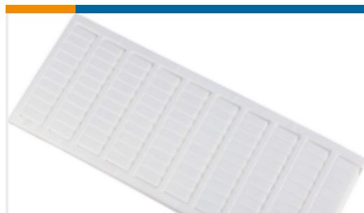
TE Part #1SNK150111R0000 MC612PA 101->110 (x10) Horizontal