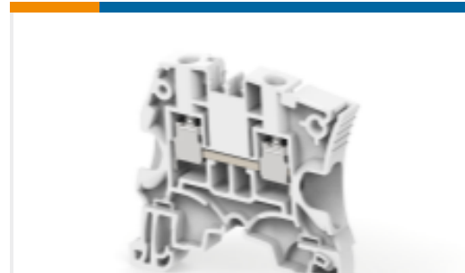
TE Part #1SNK506010R0000 ZS6