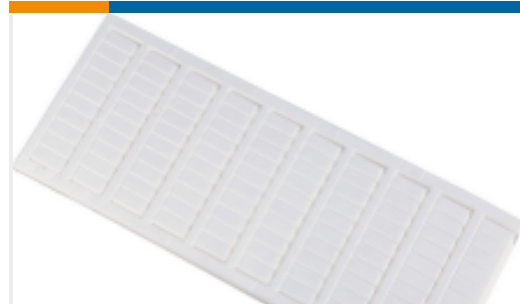
TE Part #1SNK150021R0000 MC612PA 11->20 (x10) Horizontal