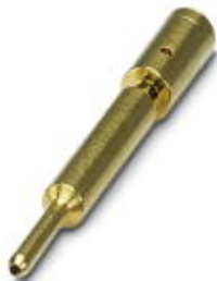
Crimp contact, turned, Single contact, contact diameter: 1 mm, crimp range: 0.5 mm 2 ... 1 mm 2

Please be informed that the data shown in this PDF Document is generated from our Online Catalog. Please find the complete data in the user's documentation. Our General Terms of Use for Downloads are valid ( http://phoenixcontact.com/download )